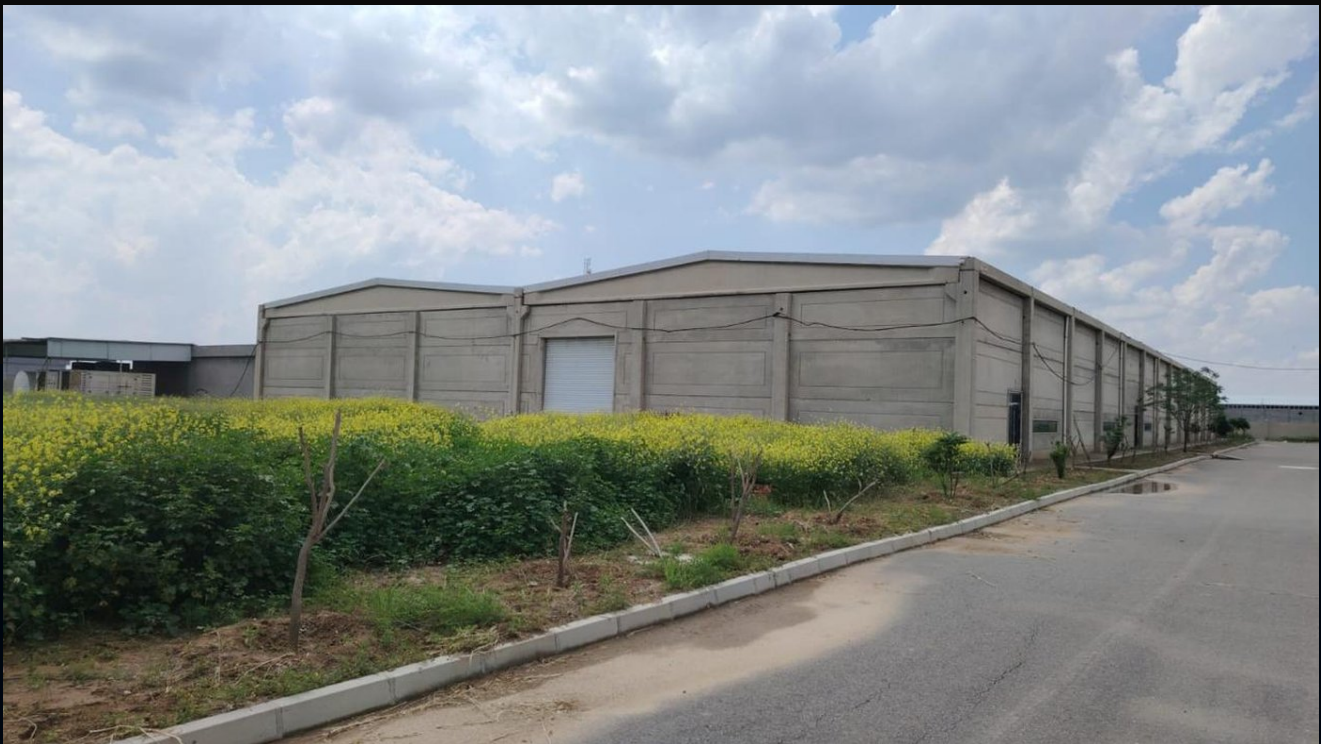
Main Production Warehouse Complex · Timmar New Industrial Zone, Erbil