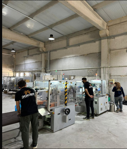
Precision Packaging Station