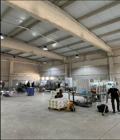
Full Production Floor