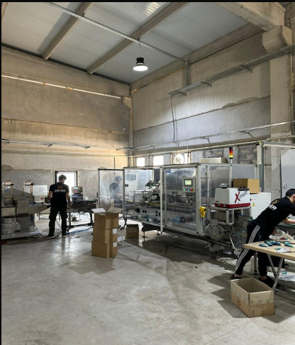
hhs Xmelt — Active Operation