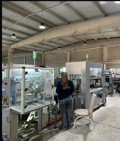
German Packaging Line — Live