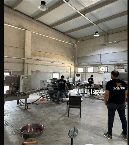
Flavour Blending & Packaging