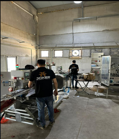
Flavour Preparation Station