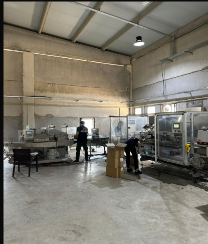
Full Production Line Overview