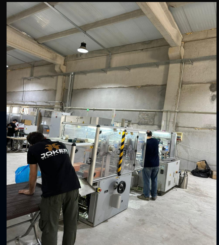
Quality Check & Assembly